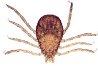
Figure 1: An adult tick is just 1-2mm long

Part the hair and look for areas that are red and raised or a "tick crater" which is evidence of where a tick once was.